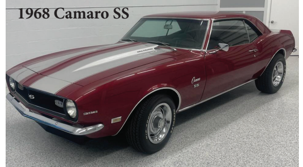
1968 Camaro SS